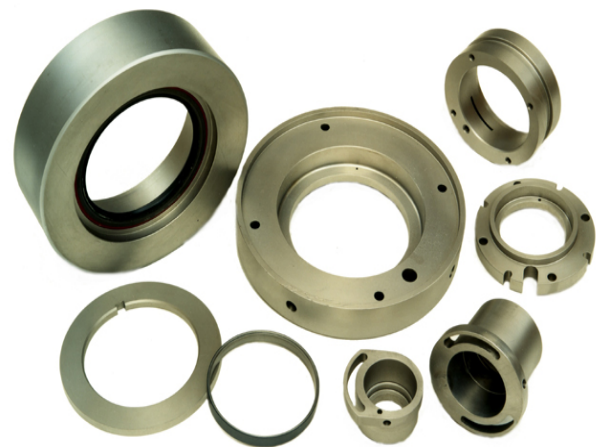
Bearings and Seal Kits