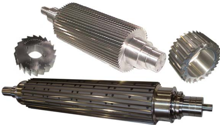
Automatik, Cumberland, Scheer, Conair, Accrapak, Reduction, Etc.

Bay Plastics Machinery offers spare parts for all makes of pelletizing systems, from feed rolls to new or repaired rotors, even sharpening your existing rotors. We can supply parts for most models of Automatik, Cumberland, Scheer, Accrapak, Reduction, and are willing to reverse engineer parts for any other brand or model you have.